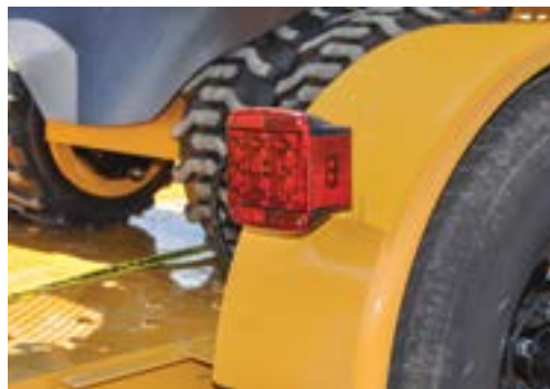
Reliable LED lighting. Right and left tail lights, license plate lighting, DOT approved.