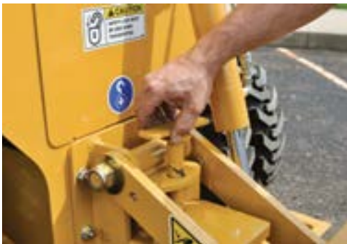
The stump cutter is held to the trailer with simple and secure pins, eliminating chains and binders.