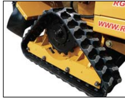
Rubber Track Undercarriage