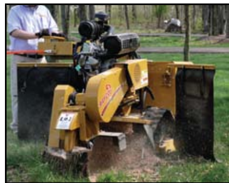
Swing-Out Chip Retainers

We've raised the bar on Compact Stump Cutters.