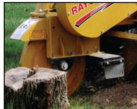
47" Cutting Width