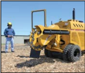
RG70R with Remote Control