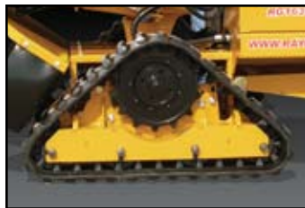
Rubber Track Undercarriage