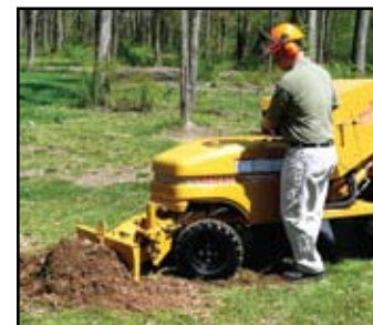
Hydraulic Backfill Blade

(photos shown with optional utility hitch / lifting eye / 2-joystick controls)