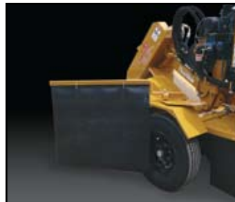
Swing-Out Chip Retainers

If you're looking for the power, cutting dimensions, and chip capacity that only a tow-behind stump cutter can provide, look to RAYCO's Tow-Behind line-up for industry leading performance. The RG100DXH features a 99 hp Kubota turbo-diesel engine and 96.5-inch cutting width. This powerhouse tow-behind machine meet US EPA Tier III emissions and feature RAYCO's Command Cut automatic swing speed control, hydrostatic cutter wheel drive with "Quick-Stop" cutter wheel, and 26-inch hole depth across the entire width of cut.