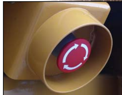
Emergency shutdown button located by control station.