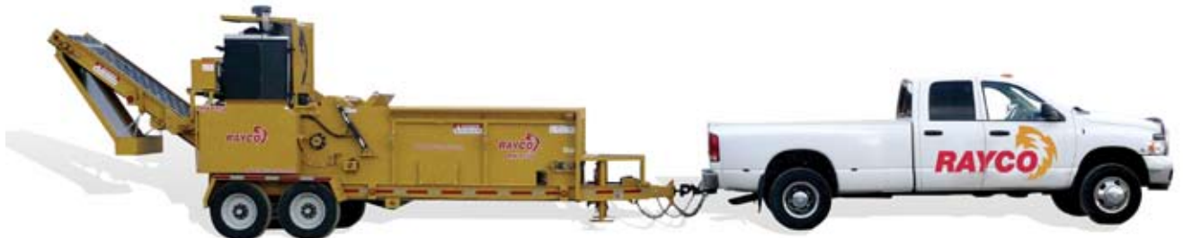
At 14,500lbs, the RH1754 can be towed behind most 1-ton pick-ups.