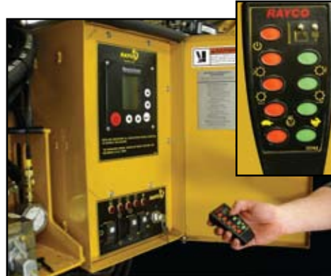
Radio remote control and digital instrument display