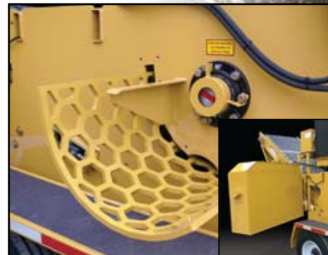
Swing-away fuel tank allows for easy screen changes in less than 10 minutes.