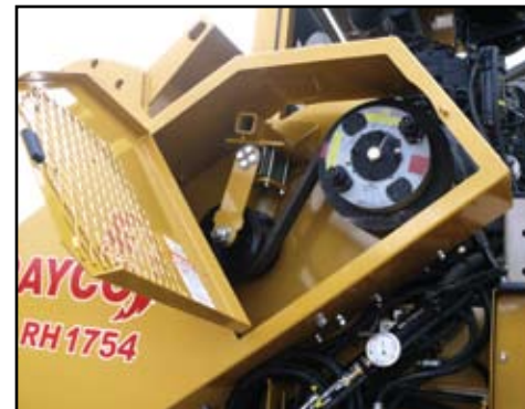
Optional torque limiter to minimize damage caused by high impacts.