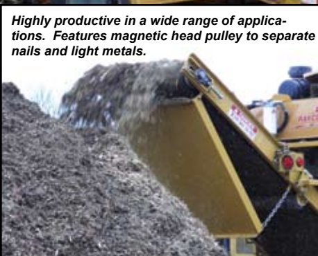
Highly productive in a wide range of applications. Features magnetic head pulley to separate nails and light metals.

Think Smart, Think Safe..... We care about your safety. When operating your RAYCO machinery always wear an approved helmet complete with ear muffs, face shield and the proper eyewear. Never operate under the influence of alcohol or drugs. Know your RAYCO, read and understand your owner's manual cover to cover.