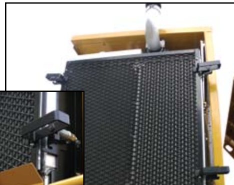
Large radiator with removable debris screen and reversing fan.